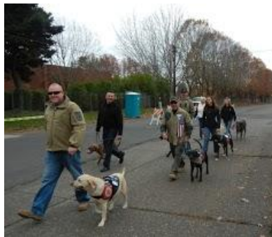
Veterans Day Walk November 10